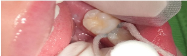
Superfloss technique w/ blue Advantage Arrest

Can be used on cavities in between the teeth!